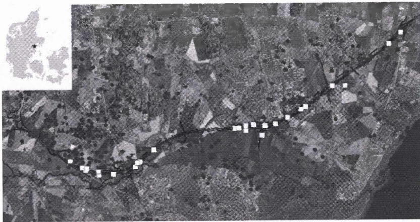
Figure 1 Administration of archaeological data. Map showing the project area with the construction plans of the highway inserted and linked with information from The Danish National Record of Sites and Monuments. White rectangles represents known registrations on the 13.6 km highway tracé combined with newfound sites from field reconnaissance in the area

gical object, state of investigation and status. On this basis we were able to give an impression of the archaeological interests in the area. After this operation status was that 20 sites must be excavated within two years by 5 excavation teams employing all in all 40-45 archaeologists and students. To carry out this task and to avoid a situation by which we would end up with an overwhelming mass of finds and paper recorded data and no energy left to take hand on the final reporting, we formulated a set of wishes and preconditions for a system that could ease and rationalize the task of data recording and reporting.