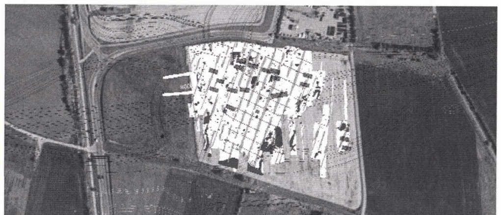
Figure 4 Digital area plan. Example of an excavation plan digitised in MapInfo superimposing an ortophoto

MapInfo is a GIS like program with geographic objects linked to information in tabular data. It has been introduced to Danish archaeology by the national archaeological authorities as a standard to be used in the digital recording of archaeological area plans.